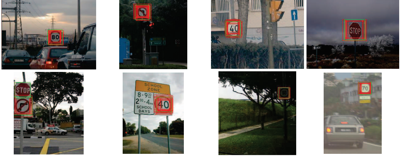
Figure 3. The experimental results of the proposed method which covers weather, illumination effects, and occlusion (The red rectangle expresses the candidate, the green rectangle represents the final decision)

SVM. Each candidate is marked by the square of 2\sigma+1 pixels and clustered by 8-neighborhood recursive segmentation method. The green rectangle is drawn by the average position of the clustered red rectangles and the largest scale among those.